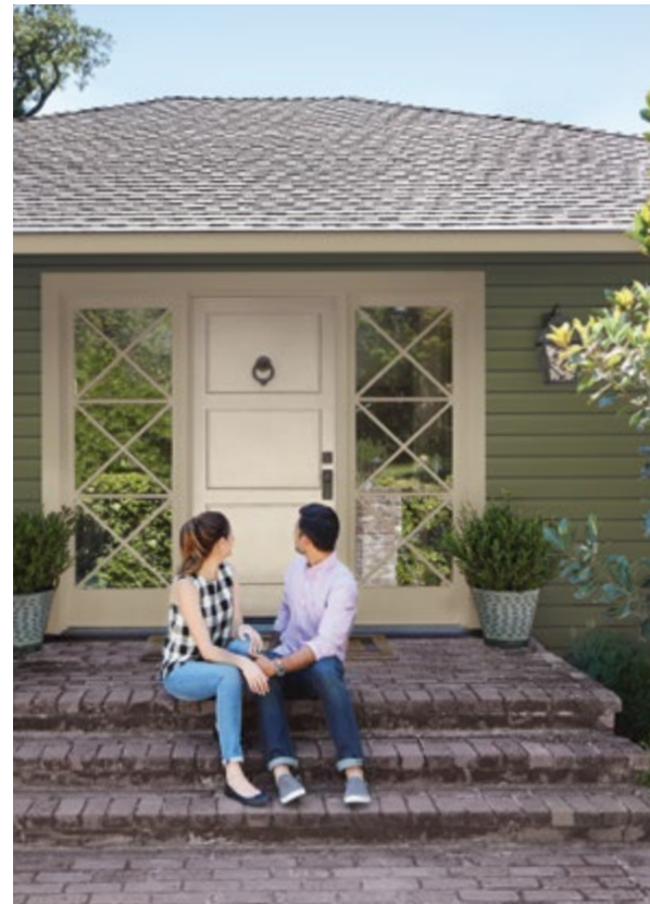
Elm Grove™ D4DL in Cypress, Exterior Portfolio® Vinyl Trim in Rye

PVC resin is the backbone of our vinyl siding, and begins with two abundant building blocks: chlorine from common salt and ethylene from natural gas. The PVC resin is optimized with a range of other proprietary ingredients to provide a reliable exterior product that can be formed into a range of shapes, and last a lifetime.