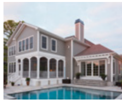
CELECT® CELLULAR COMPOSITE SIDING