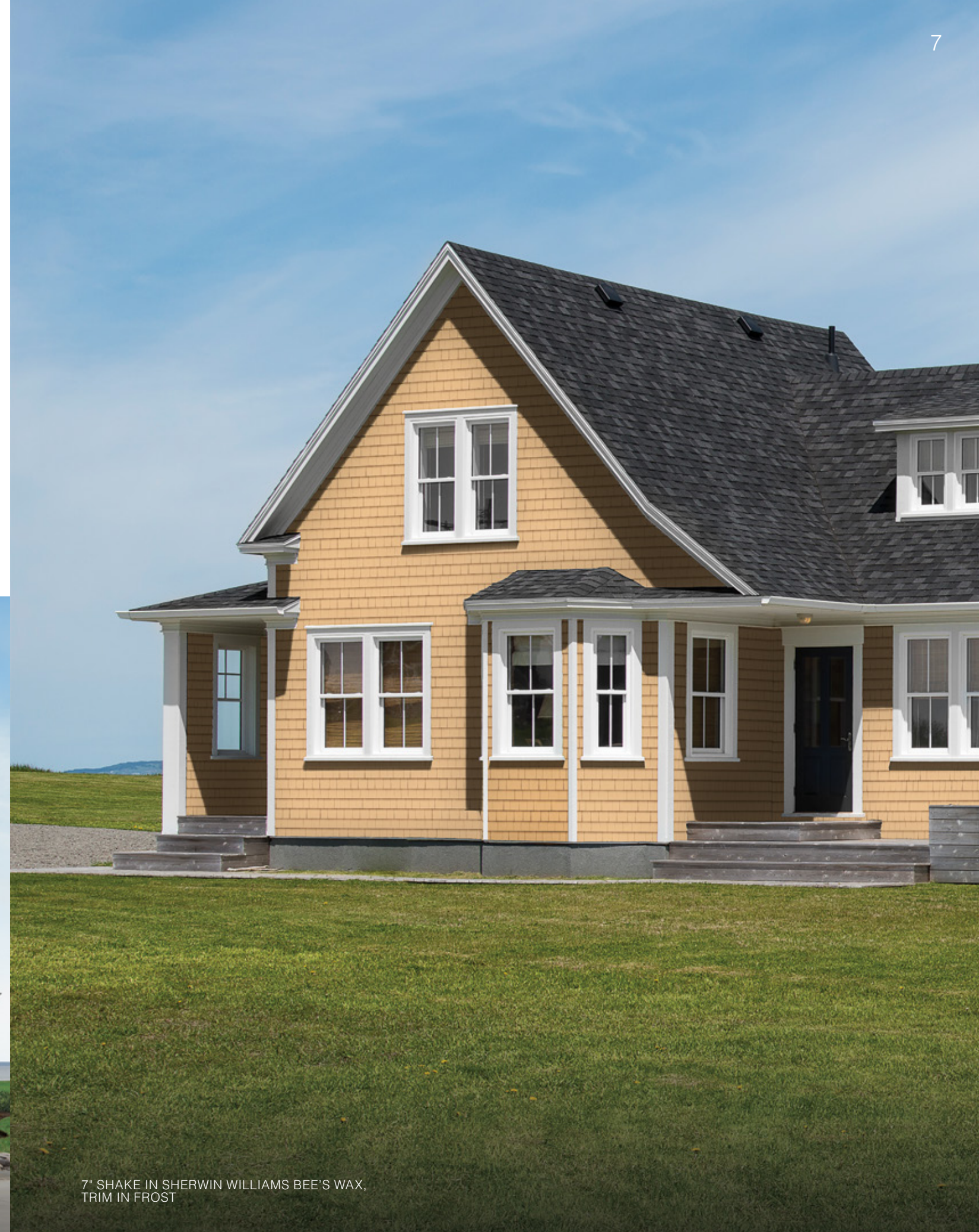
7" SHAKE IN SHERWIN WILLIAMS BEE'S WAX, TRIM IN FROST