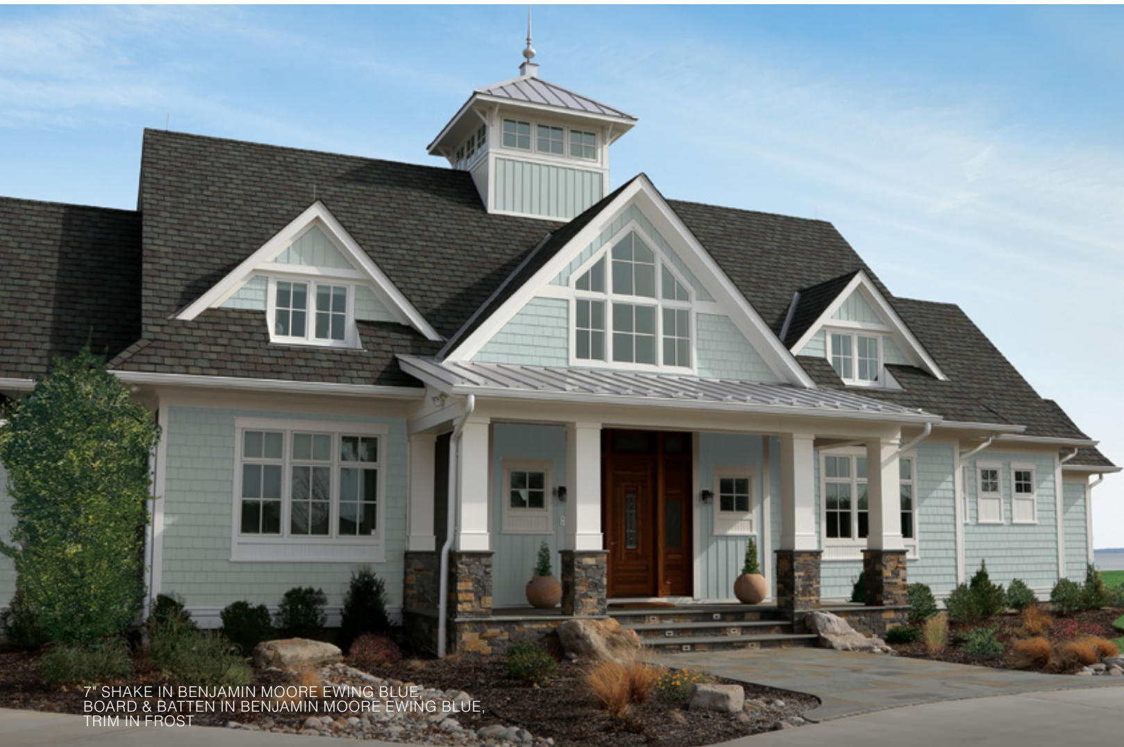
7" SHAKE IN BENJAMIN MOORE EWING BLUE, BOARD & BATTEN IN BENJAMIN MOORE EWING BLUE, TRIM IN FROST

Color warranty does not apply to Celect Canvas. For full product warranty information, please refer to our Celect Warranty.