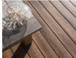
ZURI® PREMIUM DECKING