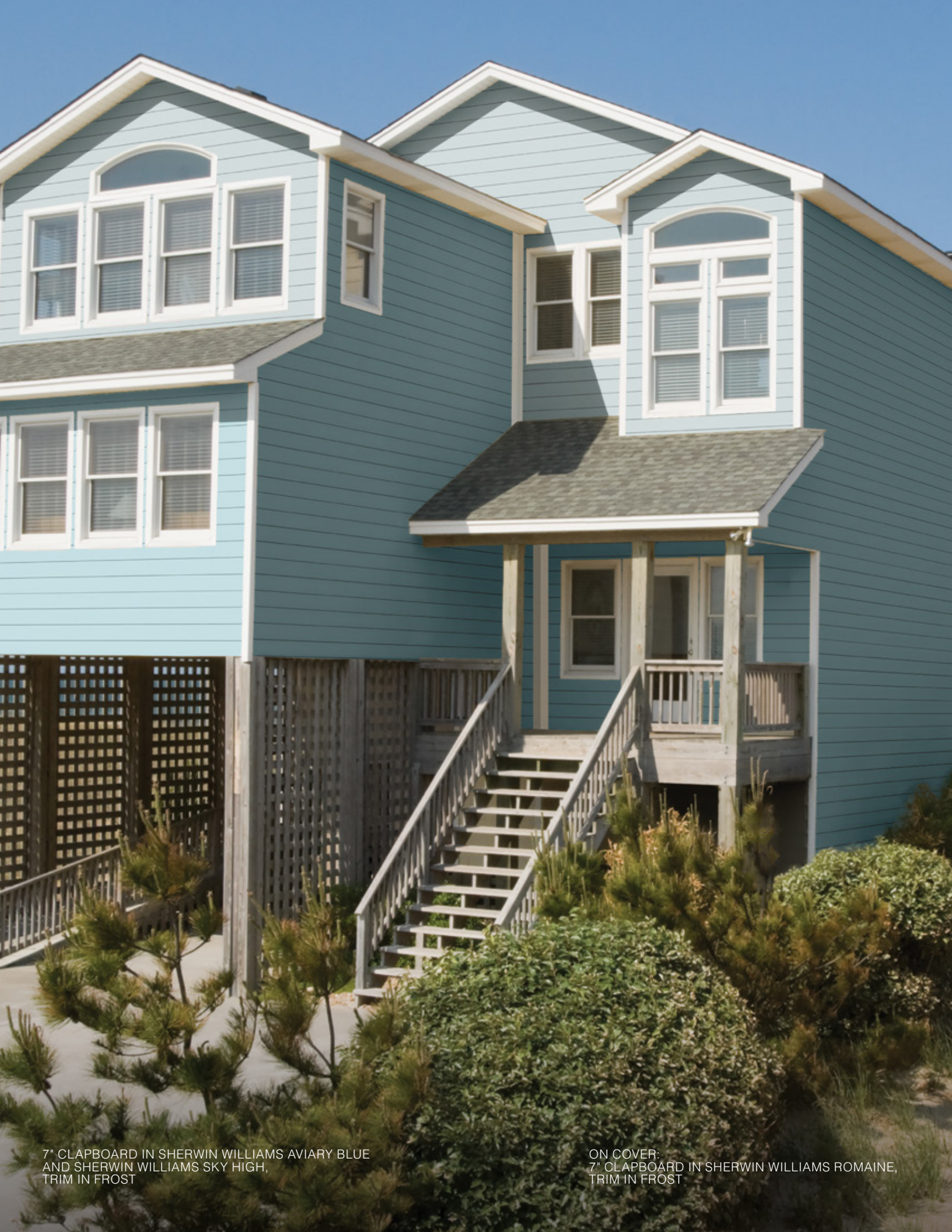
7" CLAPBOARD IN SHERWIN WILLIAMS AVIARY BLUE AND SHERWIN WILLIAMS SKY HIGH, TRIM IN FROST