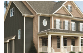
ROYAL® SHUTTERS, MOUNTS & VENTS