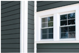
ROYAL® TRIM & MOULDINGS