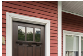
ROYAL® VINYL SIDING