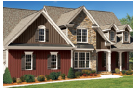
HAVEN® INSULATED SIDING