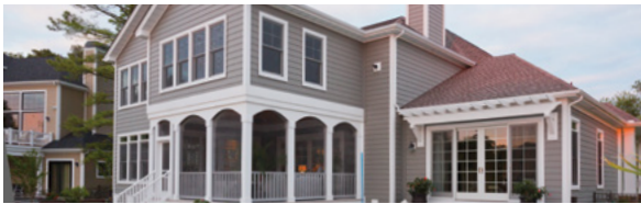
CELECT® CELLULAR COMPOSITE SIDING