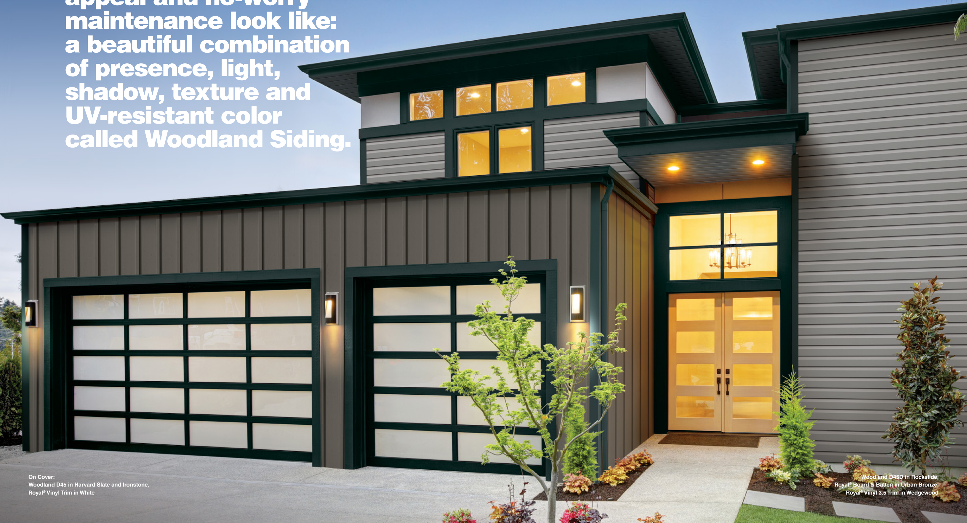
On Cover: Woodland D45 in Harvard Slate and Ironstone, Royal® Vinyl Trim in White

This is what real curb appeal and no-worry maintenance look like: a beautiful combination of presence, light, shadow, texture and UV-resistant color called Woodland Siding.