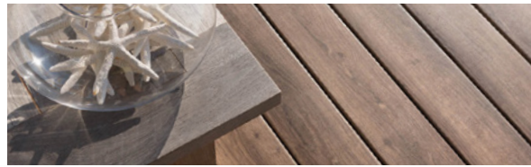
ZURI® PREMIUM DECKING