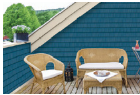
PORTSMOUTH™ SHAKE & SHINGLES