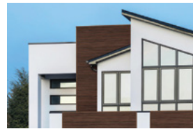
CEDAR RENDITIONS™ ALUMINUM SIDING